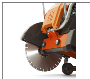
LOW VIBRATIONS Engine and blade shaft mounting system increases comfort and gives excellent cutting performance.