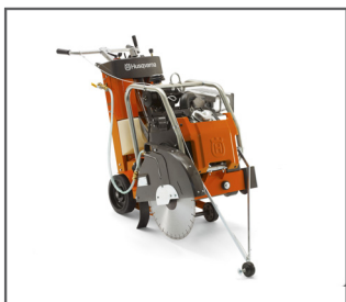
SELF-PROPELLED For easy operation and comfort.

Our convenient FS 524 is a powerful, yet compact, self-propelled petrol floor saw ideal for asphalt and concrete cutting. Suitable for small to medium-sized service and repair jobs, up to 241 mm cutting depth. The optimal power transmission makes it ideal for more demanding jobs, despite its compact size. User-friendly and developed with a clear focus on your comfort.