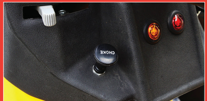
Dashboard with slide throttle control, 2 indicator lights, integrated choke and waterproof ignition.