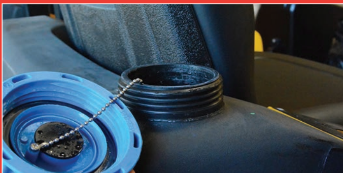
Plastic water tank eliminates rust and pressurized system provides better water flow.