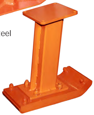
6.5" W X = Steel and wood