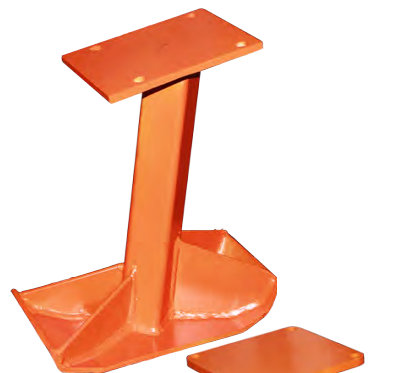
6.5" W XA = All steel