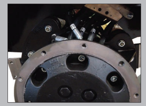
Hydraulic Hose Network Easily accessed through the drums with no special tools required. All hoses are routed to prevent wear and numbered for easy identification.